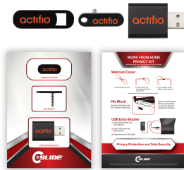
WORK FROM HOME PRIVACY 3 PACK - BLACK - STANDARD PACKAGING